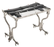
939 Instrument support for stretchers