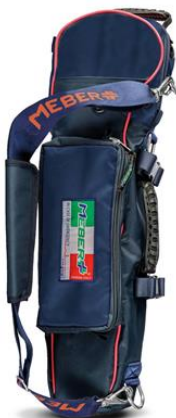
12072/BR "COVER OX 5 BR"- professional cylinder holder for 5 lt oxygen bottles