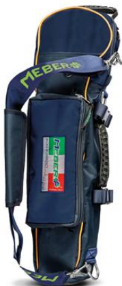
12072/BG "COVER OX 5 BG"- professional cylinder holder for 5 lt oxygen bottles