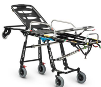
Mercury EL 7094 PROOF Certified self-loading stretcher - high version