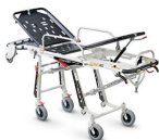
Mercury Lite 7080/4RG Proof Ambulance cot in aluminium with variable height and four swivel castors