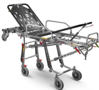
Mercury Cinque 7075/4RG PROOF Certified 5 levels self-loading stretcher with 4 swivel wheels