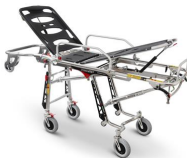
Mercury 7070/4RG PROOF Stainless steel variable height stretcher certified with 4 rotating wheels