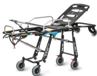
Mercury EL 7092 PROOF Certified self-loading stretcher