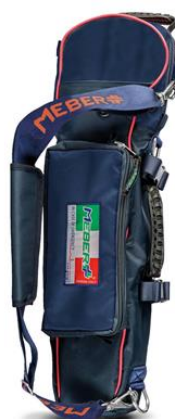
12072/BR "COVER OX 5 BR"- professional cylinder holder for 5 lt oxygen bottles