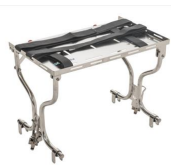
939 Instrument support for stretchers