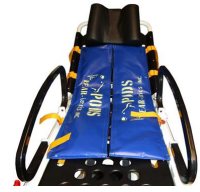
12154 "BEAR PODS" Bariatric containment system for self-loading stretchers