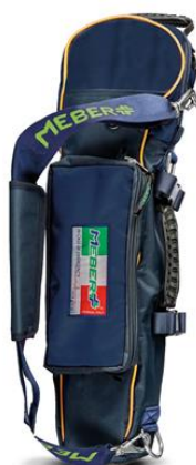
12072/BC "COVER OX 5 BC"- professional cylinder holder for 5 lt oxygen bottles