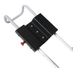
12128 Adjustable system for headrest of Meber-X and Mercury stretchers