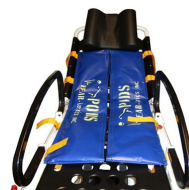
12154 "BEAR PODS" Bariatric containment system for self-loading stretchers