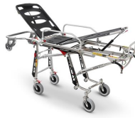
Mercury 7070/4RG PROOF Stainless steel variable height stretcher certified with 4 rotating wheels