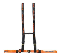
612/AN-2/MEB Adjustable thoracic abdominal belt