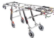
Titanus 7062/4RG PROOF Stainless steel variable height trolley with four rotating wheels high version