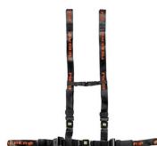
612/N-2/MEB Adjustable thoracic abdominal belt black with MeBer band and 4 points fastening for self loading stretchers and sedan chairs